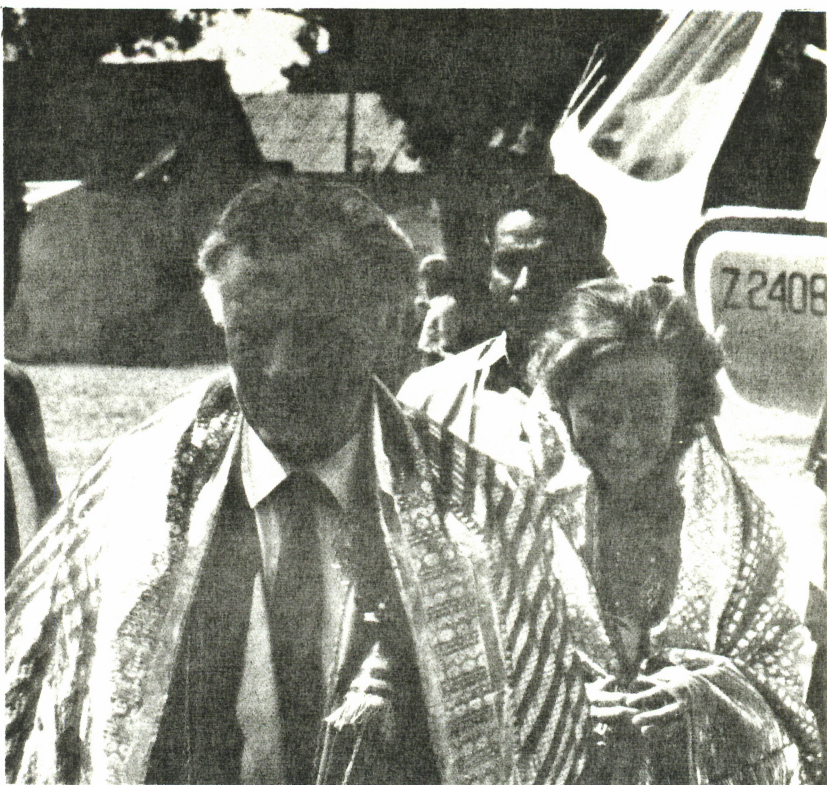
A traditional welcome for Mr & Mrs Poul Schlueter.